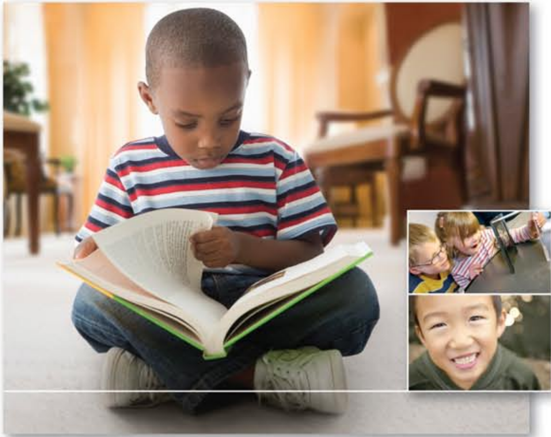
*Measurable Impact is a mark of Schlumberger © 2008 Schlumberger 10-08 0126