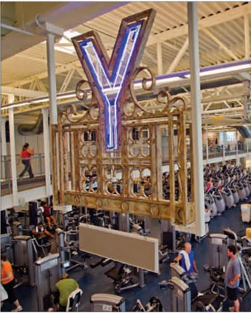
The original "Y" sign from the top of the former Downtown YMCA now hangs above the new wellness center on the fourth floor.