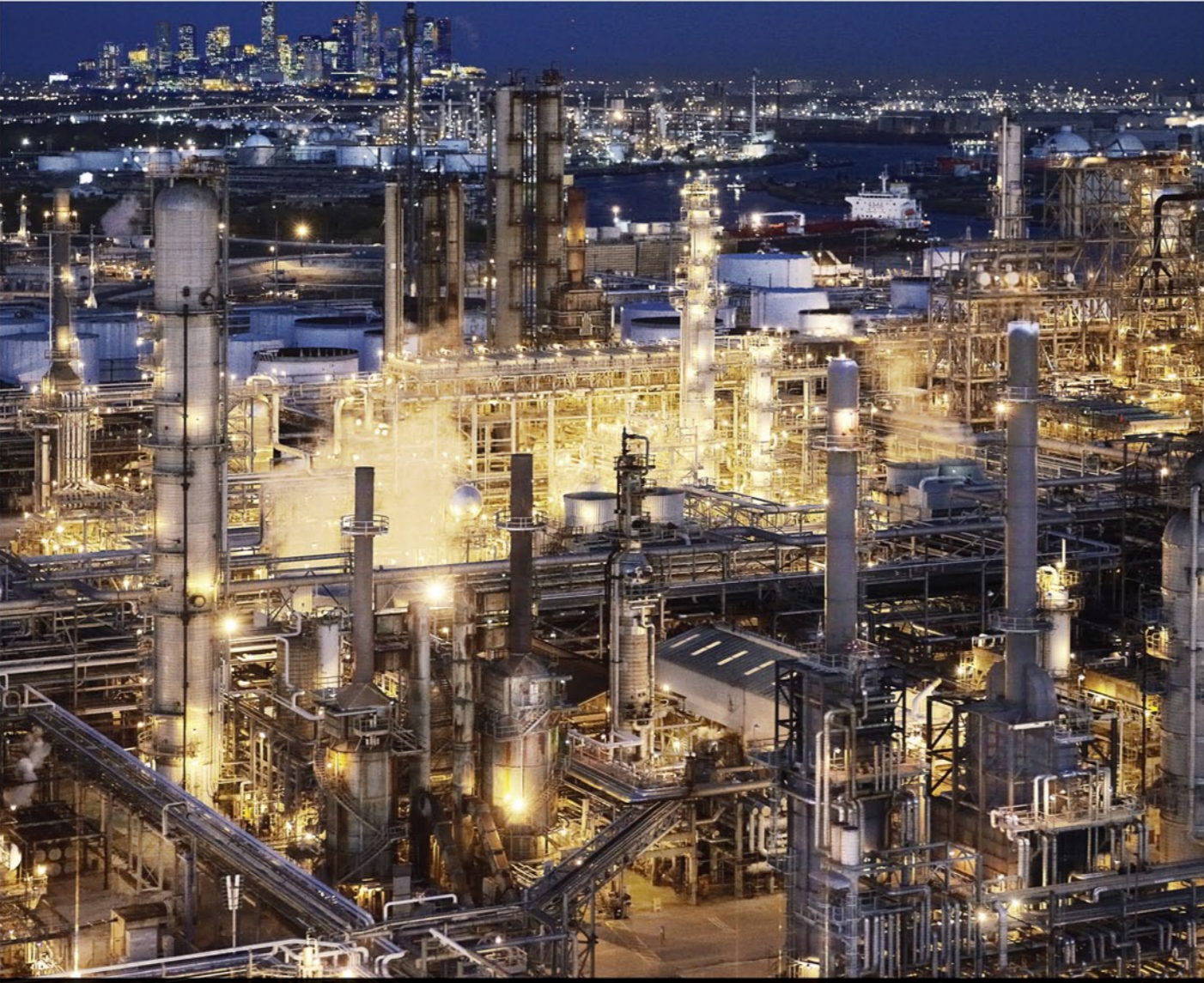
ABB also maintain offices on Houston's west side for Baldor, an ABB company. Baldor Electric Motor Company provides the industry's broadest line of energy-efficient electric motors and adjustable speed drives. The mission of Baldor is to be the best marketer, designer and manufacturer of electric motors and drives.

As energy costs continue to rise, consumers and industry leaders are searching for ways to use it more efficiently. For energy intensive industries like refining and petrochemicals, energy is a significant portion of the total production cost. Efficient energy utilization is critical to business competitiveness and bottom line results. ABB is a global leader in power and automation technologies that enable utility and industry customers to improve their performance while lowering environmental impact. ABB is proud to be one of Houston's largest energy engineering companies, supporting the efficient exploration, production, transportation, distribution and consumption of energy. www.abb.com