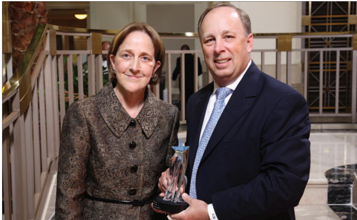
The Mischer Neuroscience Institute brings together a team of world-class clinicians, researchers and educators whose insights and research findings are transforming the field of neuroscience. Patients come to the Institute from around the world for treatment of rare and common diseases of the brain and spinal cord. The Mischer Neuroscience Institute is the largest provider of neuroscience care in south Texas. The Institute was the first center in Texas and one of only a few institutions in the country to fully integrate neurology, neurosurgery and neurorehabilitation in complementary programs offered through distinguished centers of excellence.

LEADING THE COUNTRY IN QUALITY AND PATIENT SAFETY